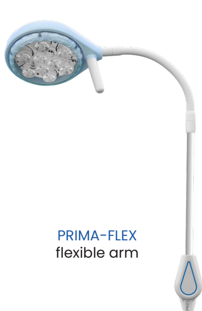
PRIMA-FLEX flexible arm

The Ergo-Spring balancing system makes PRIMALED very stable and easy to operate. PRIMALED is ideal for any type of installation, from the outpatient department to the intensive care unit.