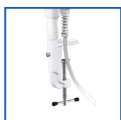
S11 Table clamp