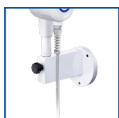
S12MED Wall clamp