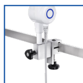
Z400819 Rail bar clamp