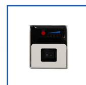
KITB24RL Battery group