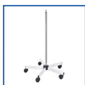
RLBI Mobile base