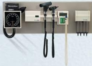
76791-4MP4 Integrated Diagnostic System (UK) 76791-2MP2 Integrated Diagnostic System (SA and Europe)