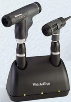
71814-MPS Desk Charger Set (UK) 71812-MPS Desk Charger Set (SA and Europe)